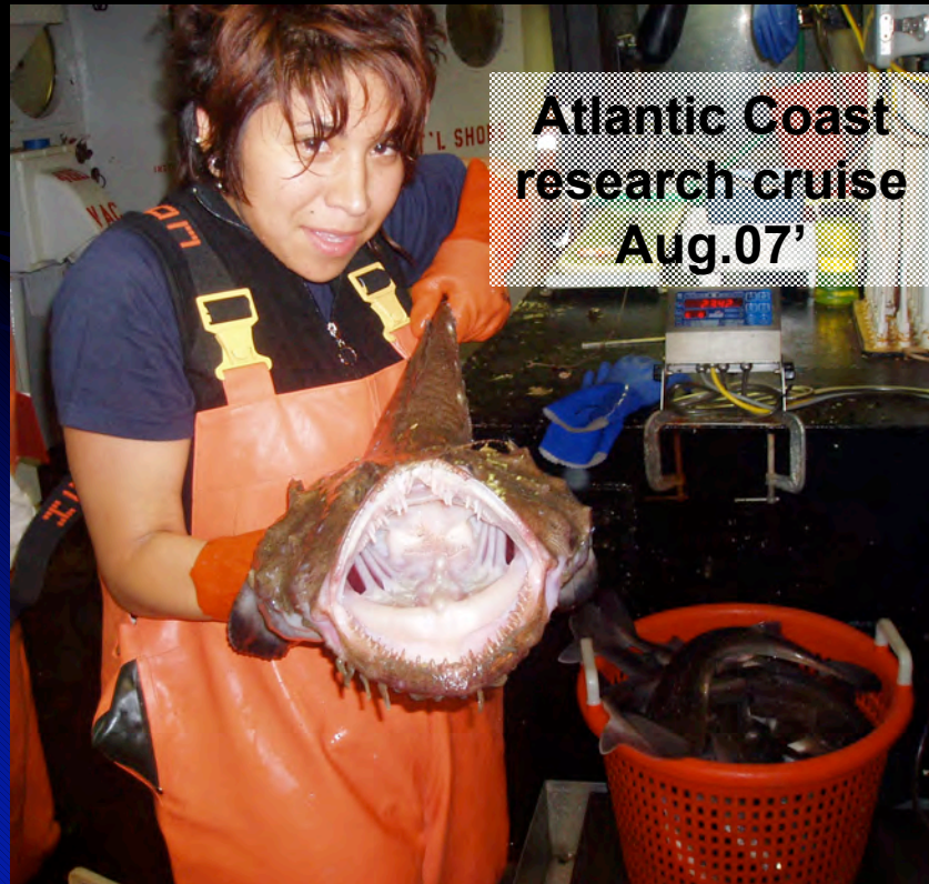
Atlantic Coast research cruise Aug. 07'