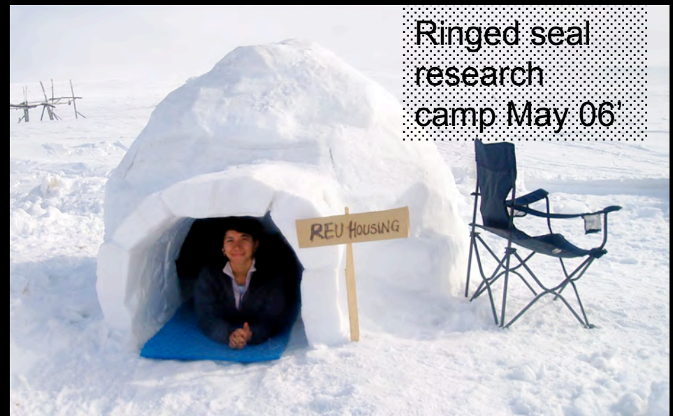
Ringed seal research camp May 06'