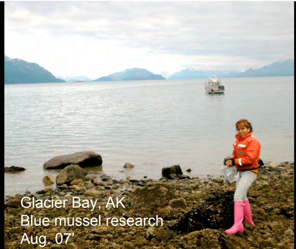
Glacier Bay, AK Blue mussel research Aug. 07'