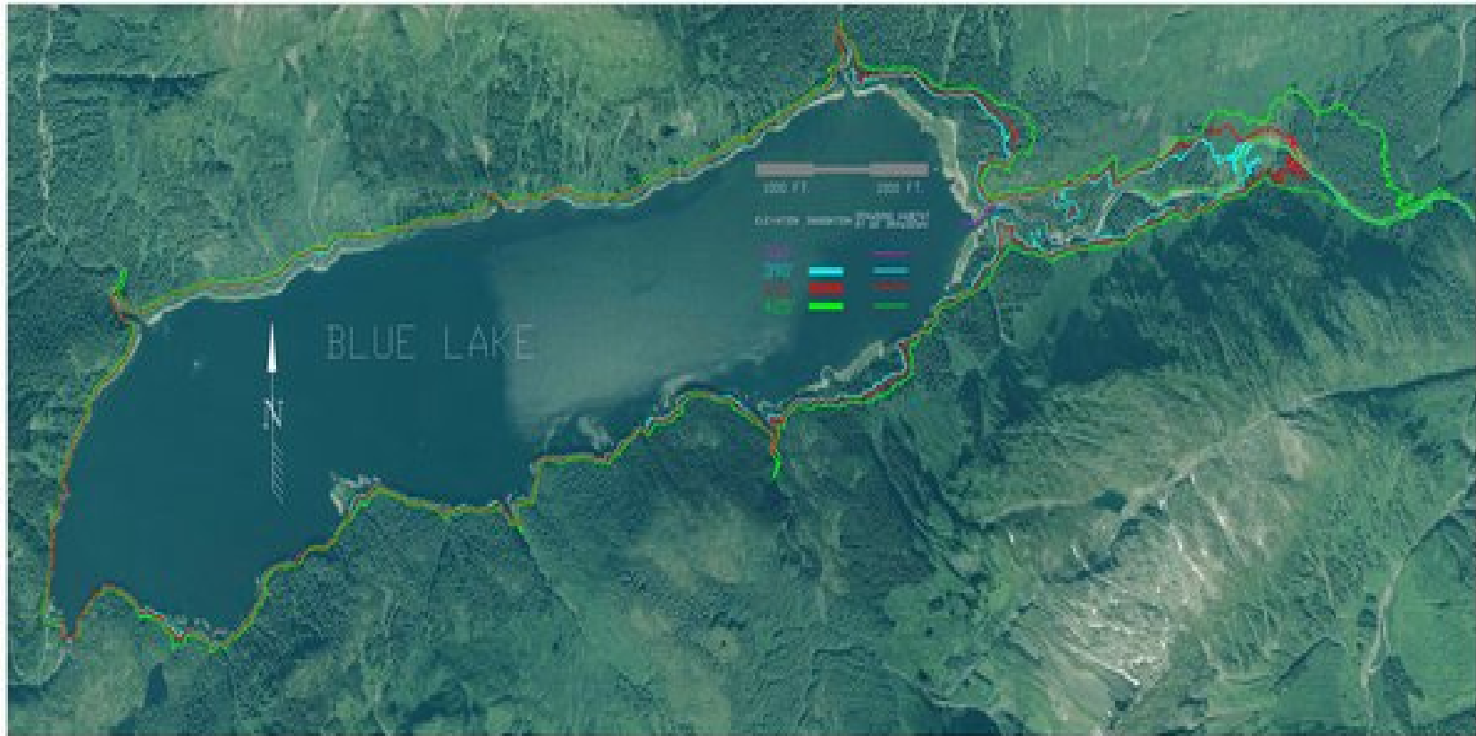
BLUE LAKE AMENDMENT INUNDATION PROPOSALS