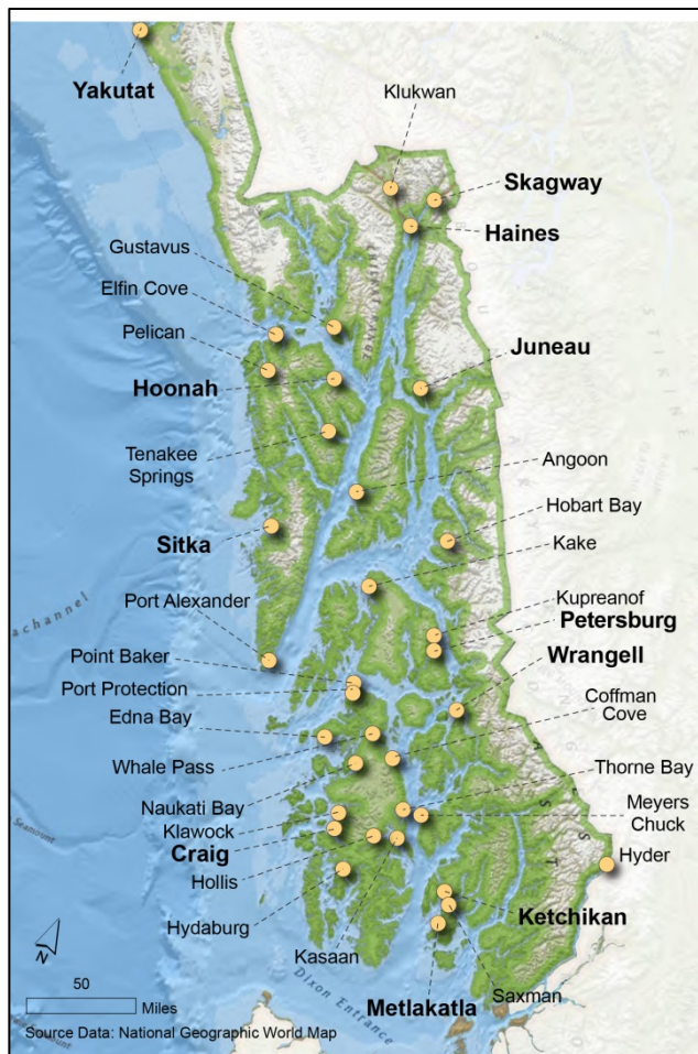
Southeast Alaska, Map by Alaska Map Company

The Southeast Alaska Panhandle, extends from the Dixon Entrance waters south of Prince of Wales Island to Yakutat in the north. This 500-mile long maritime area is home to 35 communities with just over 73,500 people, of whom 22% are Alaska Native. Islands make up 40% of the total land area and nearly 95% of the area's land base is managed by the federal government.