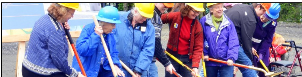
Groundbreaking- Petersburg Library

Many of you will remember the AMHS Matanuska and Ocean Beauty dock collision in 2012. Repairs are completed and the Ocean Beauty Seafood Processing facility will be operating at full capacity summer 2013. Tonka Seafoods and some local investors recently purchased the old Mitkof Cannery and will be putting it back into use soon to expand capacity for custom processing of salmon, halibut and other seafood. There is the possibility of using it to develop a market for the pink shrimp beam trawl fishery. Petersburg supports any added seafood production.