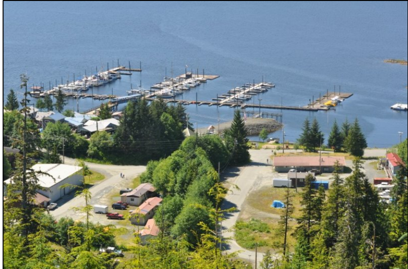
Thorne Bay, Alaska

In Thorne Bay we recently replaced our street lights with LED bulbs and installed a 2 nd dock to our harbor system, on the South Side of Thorne Bay, that provides added room for approximately 50 boats. We also purchased a restaurant that the City is currently leasing; this now allows us to provide a much needed service to our community and a small revenue stream for the city. For the last three years the city budget has run in the black, which is a big accomplishment in a small community in Southeast Alaska. We are also actively working with the City of Kasaan to get the Thorne Bay-Kasaan Highway completed.