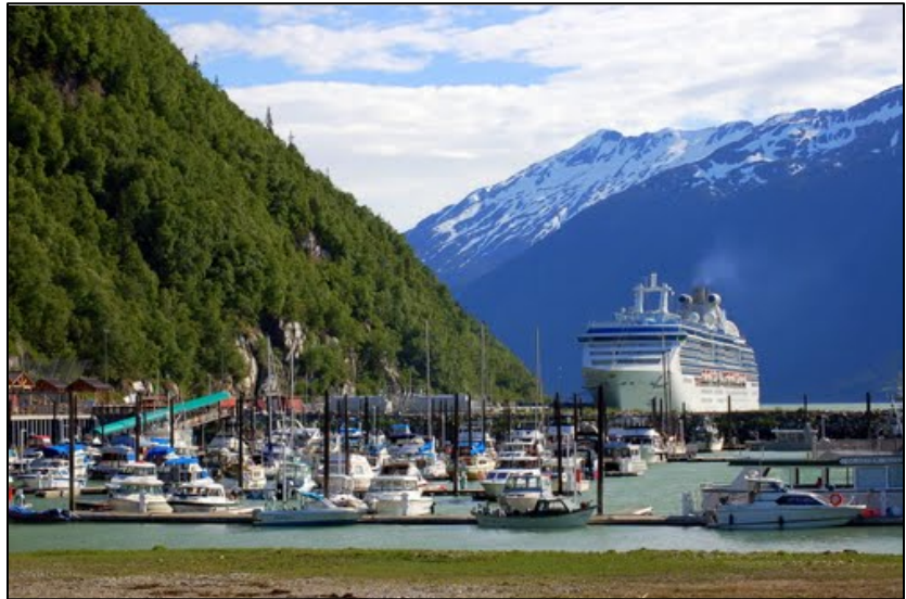
Skagway Alaska Harbor with cruise ship tied up along a Dock.

We are also working on a dock expansion project at the Skagway Ore Terminal—the so-called Gateway Project—this first phase will improve upland areas and the dock itself to support freight and ore shipments. Ore terminal owner Alaska Industrial Development and Export Authority (AIDEA) is working to expand the ore terminal to handle increasing shipments of Yukon mining company's ore through Skagway. Skagway is also expanding its public library, with the dedication of the larger facility set for early May 2013.