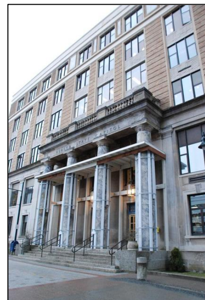
Braces on Marble Columns, State Capitol

The Alaska State Capitol is 80 years old and in need of repair. Those repairs and a remodel are starting now and will continue over the next 4-5 years; right