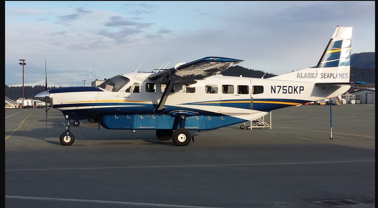
First C-208B in 2013