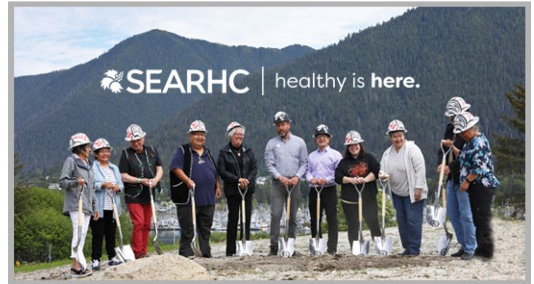
Mt. Edgecumbe Medical Center Groundbreaking June 2022

The Board is guided by the Consortium's values, vision and mission that are inclusive of all people living in the Southeast region.