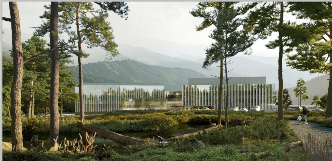
New Mt. Edgecumbe Medical Center