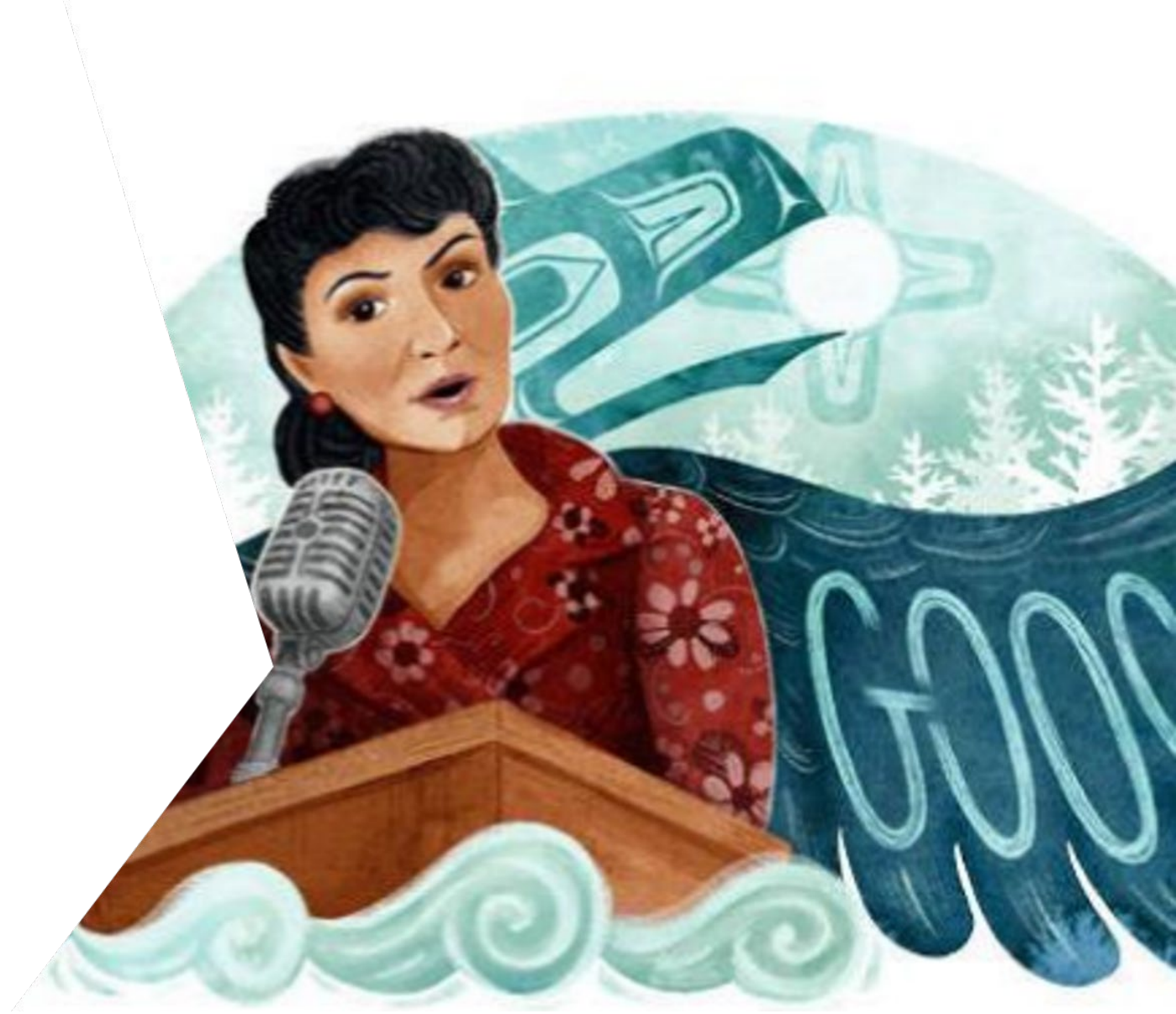
Elizabeth Peratrovich: featured in a Google Doodle on Dec. 30, 2020. The Tlingit civil rights activist was illustrated by Sitka-based artist, Michaela Goade.